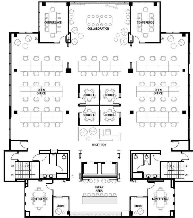
*Conceptual Furniture Layout